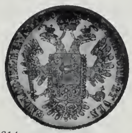
Lot No. 2614